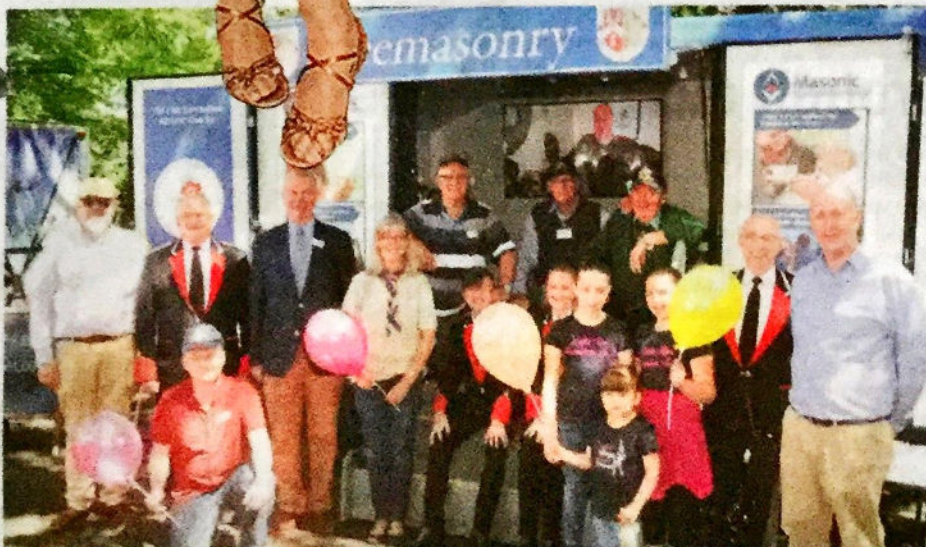
ALL YOU NEED TO KNOW: Hundreds attended the open day with a steady stream of visitors finding out about the Masons at their information stand. Above, two of the dancers who performed on the day.