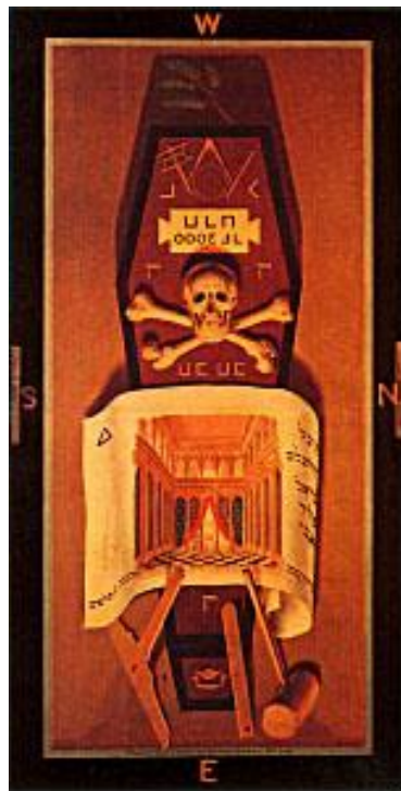
Figure 21. Third Degree, Emulation Ritual.