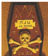
Plate 4 shows a mirror image of the Tracing board, together with the new ciphers and a four-digit number which is clearly 3000.

> L T C ⌋ ⌋ H A B ⌋ 3000 A L 3000 ⌋ ⌋ M B M B