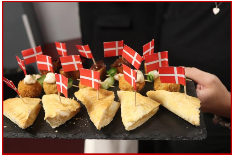
Not quite your normal Danish pastries