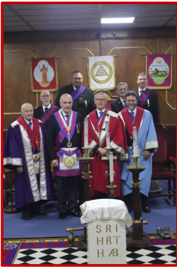
The 3 Principals with our Danish Companions