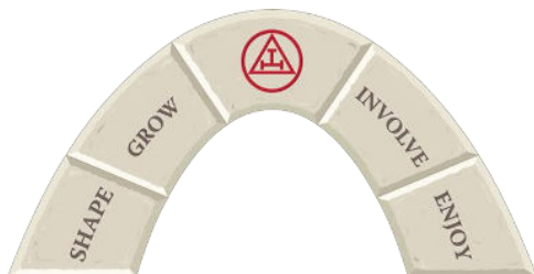
Shape - Grow - Involve - Enjoy

As the name suggests, the materials have been built around an arch. It contains four themed stones: