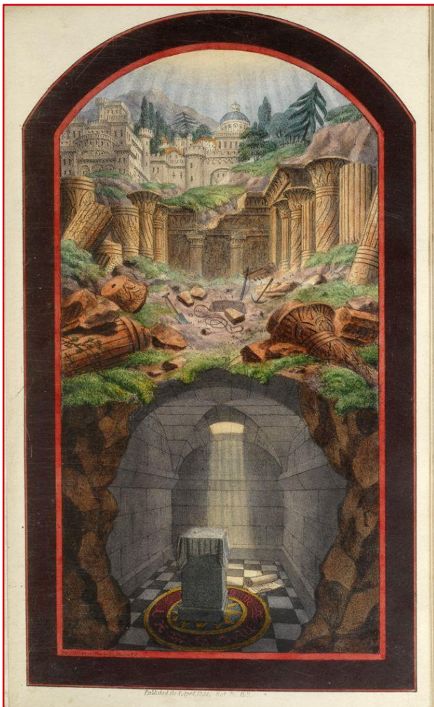
Modern day Royal Arch Tracing Board