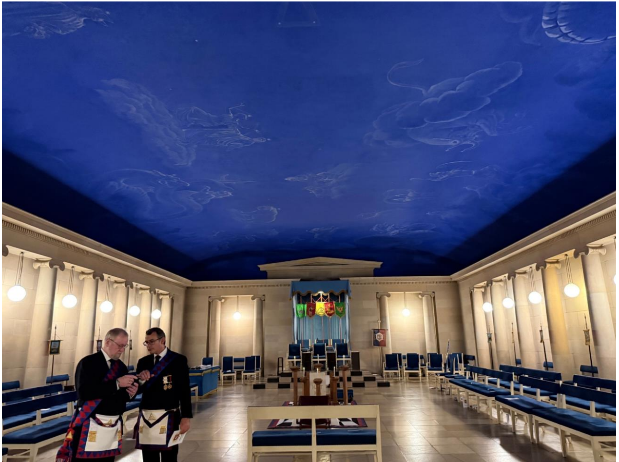
The Grand Lodge and Chapter Room, Copenhagen, Denmark

We were royally entertained in wonderful surroundings. Although the ceremony was conducted in Danish it so closely followed our ceremonies it was easy to keep up.