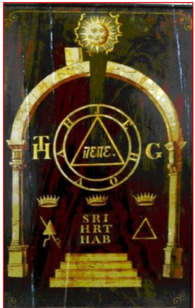
Cana Chapter Tracing Board is one of several 18th century Royal Arch Tracing Boards still in existence

https://www.eastlancashirefreemasons.org/wp-content/uploads/2016/06/Lancashire-PGMs.pdf